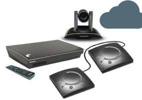
COLLABORATE Pro 600