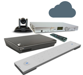
COLLABORATE Pro 900