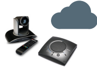
COLLABORATE Versa 100