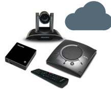
COLLABORATE Pro 300