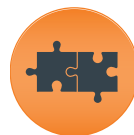
Integration to the Workflow