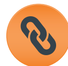
IP PBX and Call Center Integration