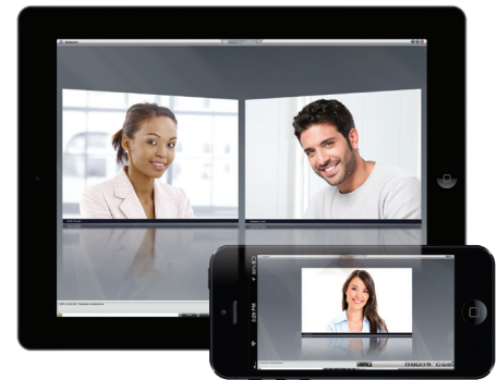
Spontania cloud-based media collaboration