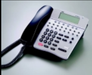
ITR-16D-2 (BK) TEL